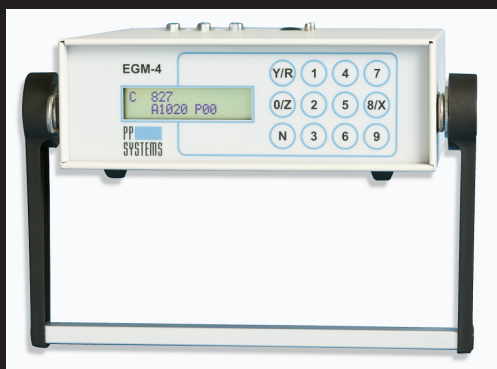
EGM-4 Environmental Gas Monitor

The TRP-2 is supplied with sample gas tubing to connect up to the infrared gas analyzer. The analyzer draws the air sample over the temperature sensor located at the probe tip. The temperature sensor is protected by an aluminum cover.