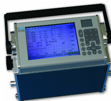
The TRP-2 can be used with the CIRAS-2 Portable, Differential CO 2 & H 2 O Gas Analyzer

PP Systems is continuously updating its products and reserves the right to amend product specifications without notice.